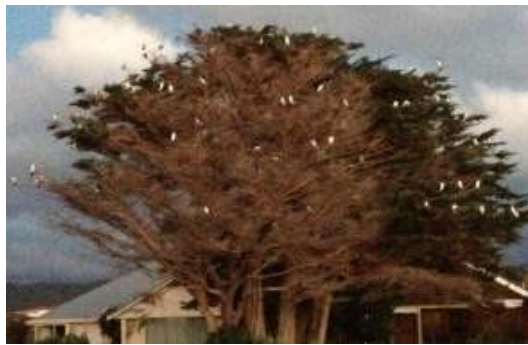
Photograph Graeme Joyce