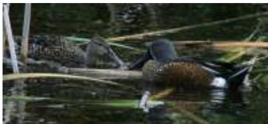
Shoveler ducks.