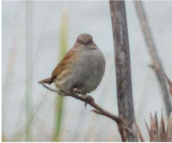
Photograph Ken Begg as long as it did, to be photographed!

The grey warbler has a wonderful song but is very hard to see as it flits from one branch to another. Its tantalising as it continues to sing its lovely song but seldom sits still for long and is hard to photograph. However taking Ken a local tourist for a tour of the estuary the other day, we spotted this bird posing for a photograph. I played my grey warbler song from my phone but it never took any notice of it. Previously if I play the song the warbler flies to check it out .