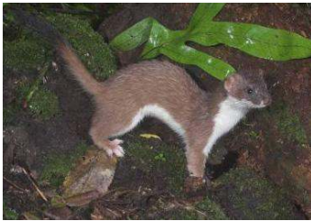
Nga Manu Images

Stoats are a problem within the estuary, although there are traps set along the river bank and in the Scientific Reserve.