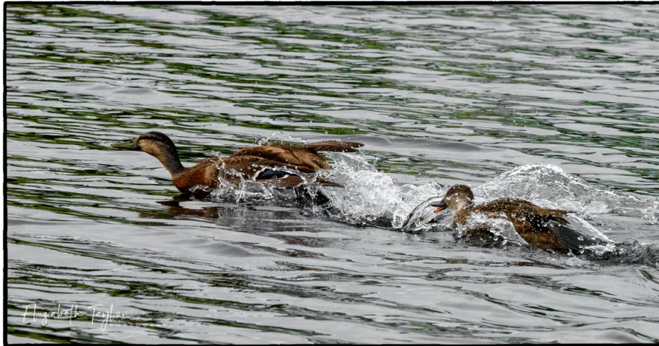
The mallard drake being chased by the grey teal.